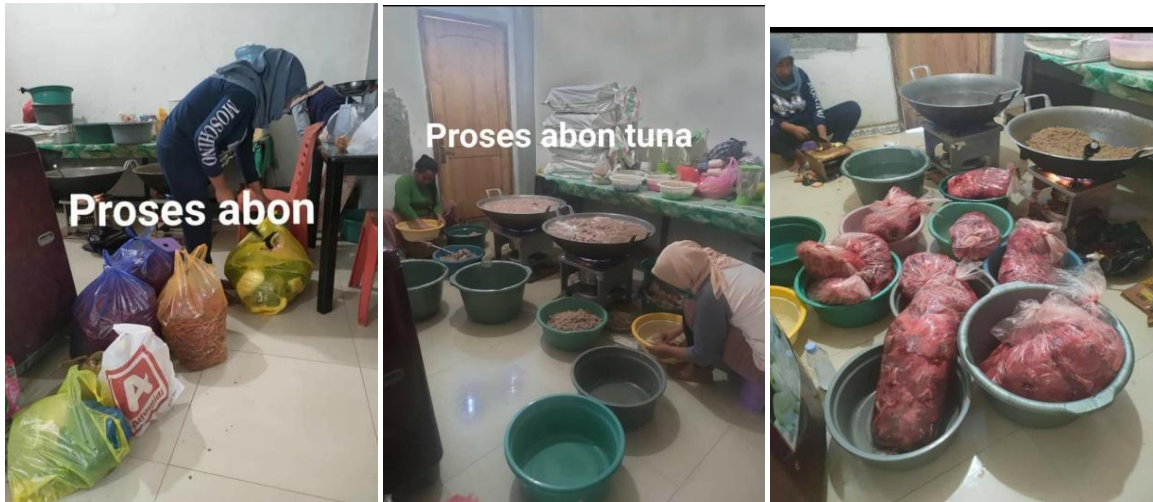
Figure 2. Production Process